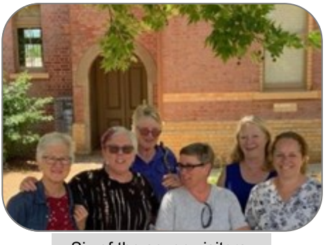
Six of the seven visitors, one behind the camera