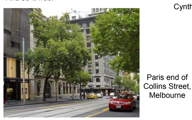
Paris end of