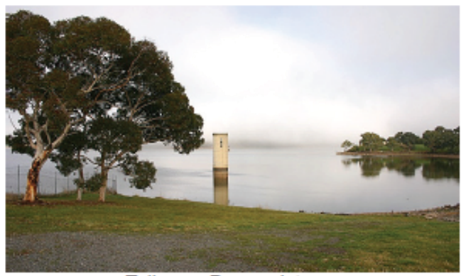
Tullaroop Reservoir tower

At this point you have two options: Continue on down to Clunes or go back to Cotswold Road and turn left and then left again down Rodborough Road to the Tullaroop Reservoir.