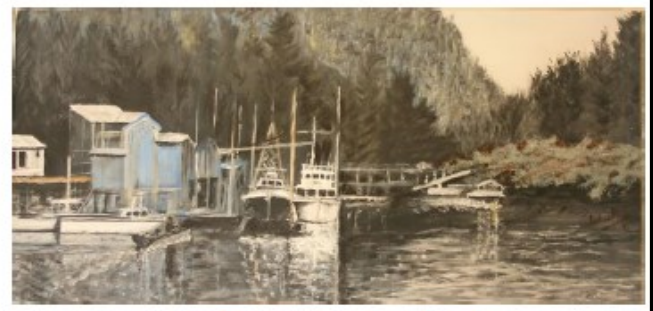
Norway and a hidden Fiord with fishing boats