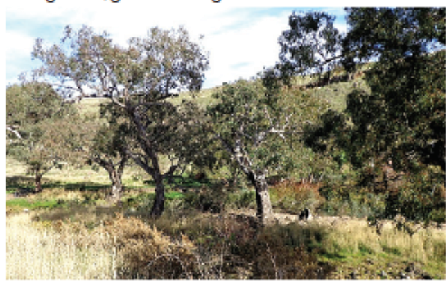
Tullaroop Creek area

My suggestion is to start in Carisbrook and have a look down the back streets at the churches, the post office, the old gaol (Bucknall Street) and the gardens on either side of Deep Creek. If you are interested in seeing more, give me a ring.