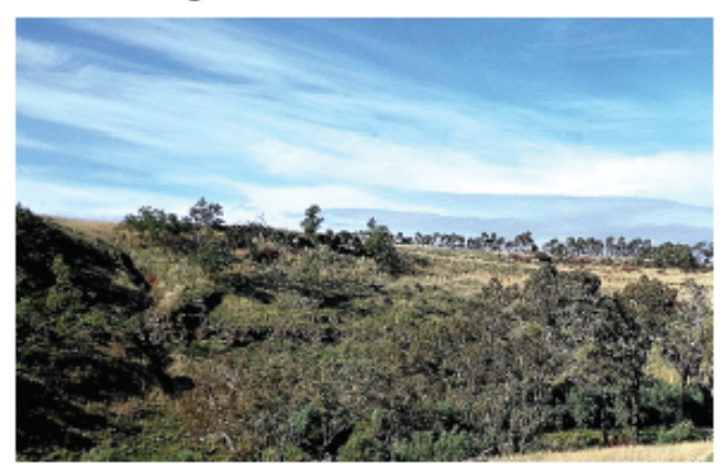
Approaching Tullaroop Creek crossing

One such area is in the Tullaroop Reservoir area, where you will find a hidden creek valley. It is not noticeable until you arrive.