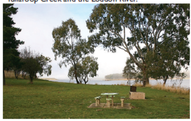
Tullaroop Reservoir picnic area

This dam wall was constructed and completed in 1959 and it provides the main supply of water to Maryborough and other local towns and villages. It also provides irrigation water for properties along the Tullaroop Creek and the Loddon River.