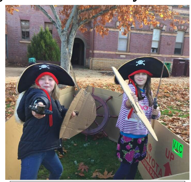
Mini pirates brandishing swords at Cardboardia