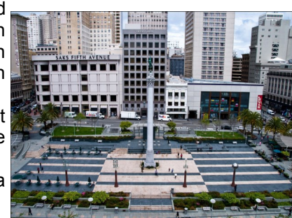
Union Square, San Francisco