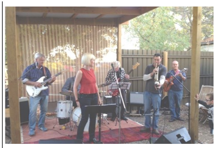
Pics from the Railwalers who performed at the Railway Hotel on Sunday afternoon.

An afternoon of lively jazz and dancing with the acclaimed jazz band Sweet Ade from Melbourne This refreshingly different six piece band plays and entertaining mix of jazz music