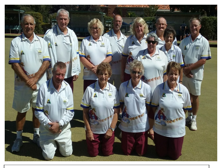
The winning team