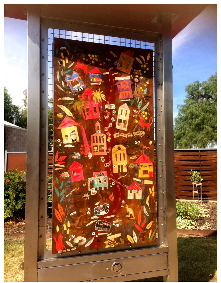
The Imagination Station I the Rene Fox gardens. Remember to push the buttons!