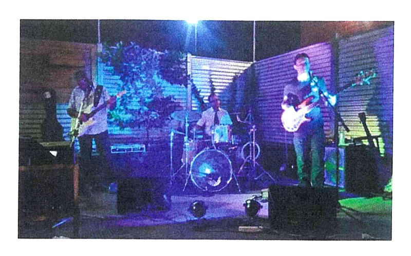
The Groove Dudes