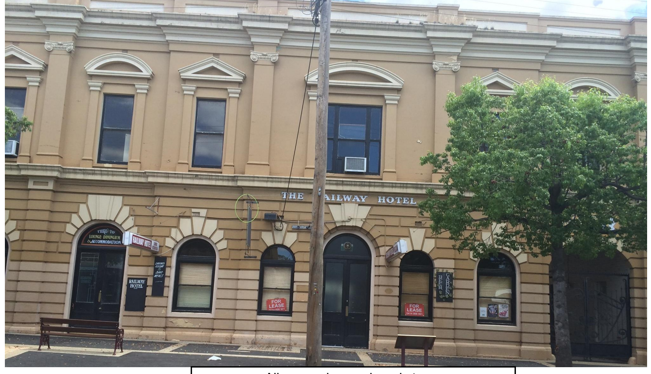
All spruced up and ready to go

Dunolly will finally have a pub again! The Railway Hotel will open its doors on Thursday 28 July 2016 for drinks and a Meet and Greet at 4pm. Everyone is welcome!