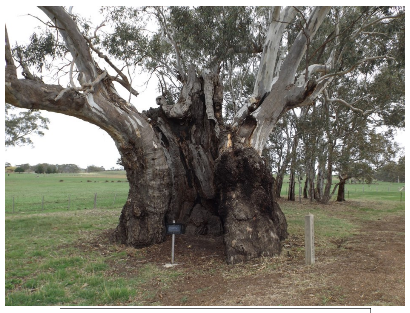
The Maternity Tree