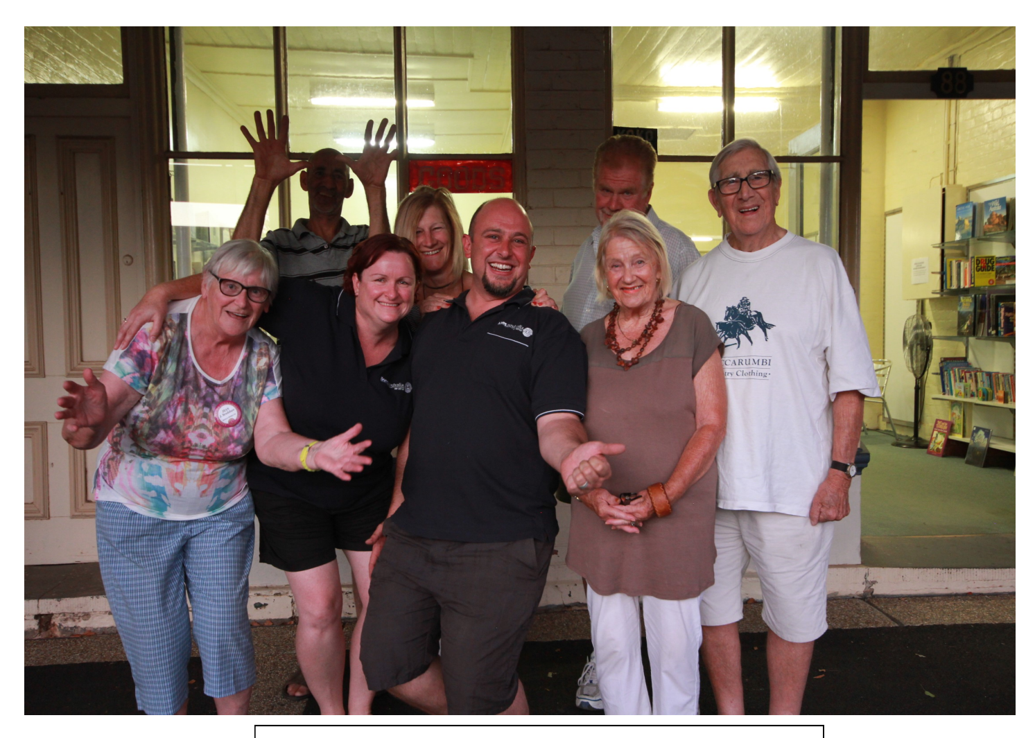
The team at Lions Bookshop